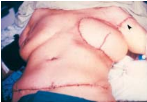
Fig. (1): b: Immediate post operative view showing the reconstructed breast and the incision in the left arm through which the cephalic vein is dissected and transposed.