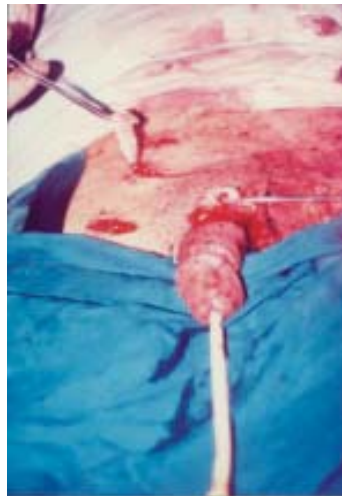
Fig. (2): b: Intraoperative view showing the replanted penis and the incision through which the right superficial inferior epigastric vein is exposed and dissected.