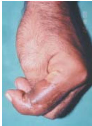
Fig. (3): d: Late post-operative view showing complete flap survival and flexion of the proximal interphalangeal joint.