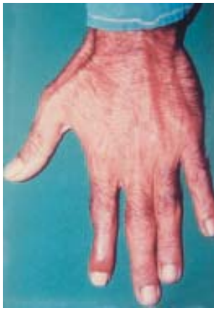
Fig. (3): a: Patient No. (4) with adherent scar on the radial side of the left index finger with stiff proximal interphalangeal joint.