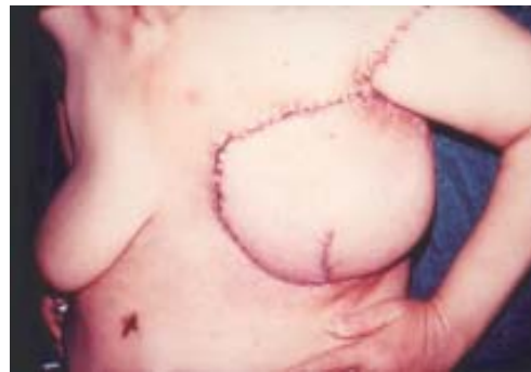
Fig. (1): c: Complete flap survival.