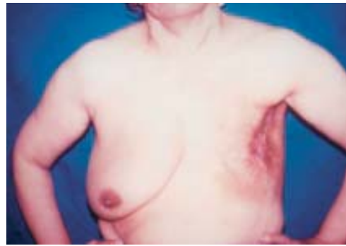
Fig. (1): a: Patient No. (1) with left radical mastectomy.

was thrombosed till the ends of the anastomosed veins. The graft was resected and the vein of the flap was shortened, irrigated till satisfactory bleeding was obtained. The great saphenous vein of the right thigh was exposed, divided just above the knee and dissected till the saphenofemoral junction (Fig. 4,d). The vein was transposed and venous anastomosis was done between it and the vein of the flap. This could salvage the failing transplant and the new penis survived completely (Fig. 4,e).