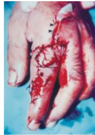
Fig. (3): c: Immediate post-operative view showing the flap in place and the incision in the dorsum of the adjacent finger through which the dorsal digital vein is dissected and transposed.